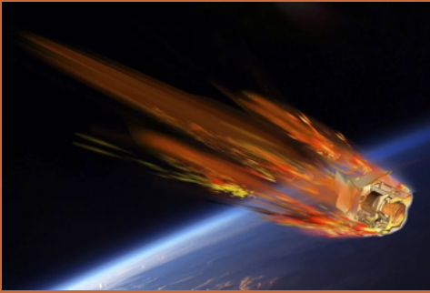
An illustration of DRACO getting destroyed in Earth's atmosphere.

The European Space Agency will launch its DRACO satellite in 2027 specifically to let it burn up on reentry, collecting real-time data on how satellites break apart in the atmosphere. The mission supports ESA's Zero Debris Charter, aiming to stop new space junk creation by 2030, and will use a sensor-packed capsule designed to survive reentry long enough to transmit data before reaching the ocean. Built by Deimos, DRACO will mimic a typical uncontrolled reentry to help scientists develop safer satellite designs.