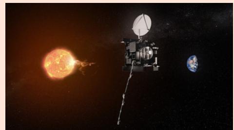
Space weather reporter Vigil in deep space.

A series of powerful solar eruptions struck Earth last week, as three rapid coronal mass ejections triggered a severe six-hour geomagnetic storm. Despite intense solar activity—including an X-class flare, radio blackouts across three continents, and a rare Ground Level Enhancement—the event caused minimal disruption to infrastructure and no danger to people. ESA missions in low-Earth orbit and deep space captured valuable radiation and magnetic data now under analysis. With the Sun at solar maximum, such storms are increasingly likely, reinforcing the need for advanced space-weather monitoring missions like ESA's upcoming Vigil.