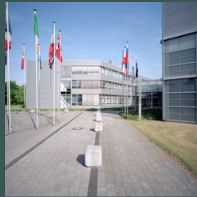
EAC site in Cologne.

ESA has signed a Letter of Intent with North Rhine-Westphalia and DLR to build a new facility at the European Astronaut Centre in Cologne, nearly tripling ESA's onsite workforce. The €20 million building, expected by 2028, will host staff relocated from the Netherlands and strengthen Cologne as the hub of Europe's human and robotic exploration. This expansion marks a strategic step toward reinforcing ESA's capabilities, training, and future missions across the continent.