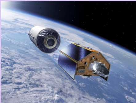
Sentinel-6B release into orbit.

On 17 November 2025, the Copernicus Sentinel-6B satellite entered orbit, continuing a decades-long mission to measure global sea-surface height. Building on Sentinel-6 Michael Freilich, the new satellite uses advanced radar altimetry to extend a record dating back to the early 1990s. These data are essential for tracking sea-level rise and guiding climate policy. Launched aboard a SpaceX Falcon 9 from Vandenberg, Sentinel-6B is now operated by ESA and will soon transfer to EUMETSAT, supporting accurate ocean and climate monitoring.