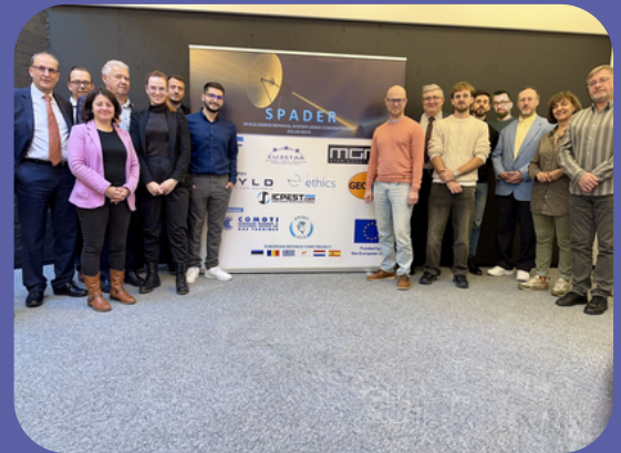
The SPADER Consortium

Project Officer from the DG/DEFIS was present and advised the plenary about some important issues regarding, workflow, reporting, deliverables and funding. The KO meeting was also connected to a virtual meeting room, where partners' personnel joined and followed the discussions. In this virtual meeting room the DG/DEFIS official and responsible for the project was connected and exchanged some interesting points of the concept.